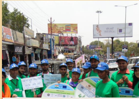
Innovations in Information Communications, Capacity Building and Behaviour Change in Informal Settlements of Jhansi