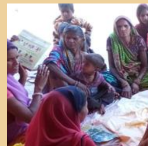
Sahbhagi Gram Panchayat Vikas Yojana, Samuhik Prayas, Satat Abhyas