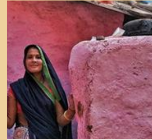
Lived Realities of Women Sanitation Workers in India