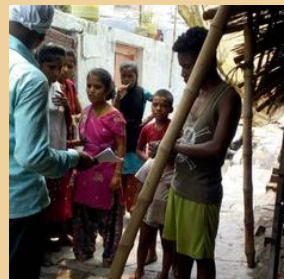
Voices of the Urban Poor - Building Organisations to Access Sanitation Services