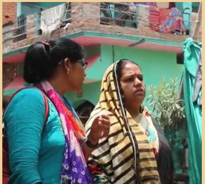
Reclaiming City Voices of the SIC Forum