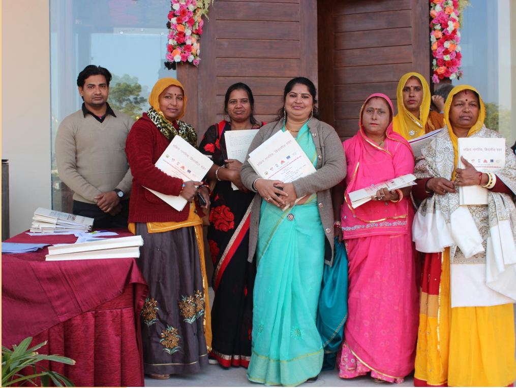
AJMER SIC FORUM MEMBERS WITH WARD NO 18 COUNCILLOR AT THE STATE CONSULTATION IN AJMER