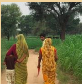
Mahila Sabhaon ka Sanchalan Kaise Kare