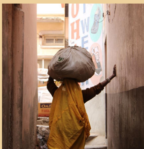
Bharat Mein Mahila Safai Kamgaron Ki Rozmarra Ki Haqeeqat