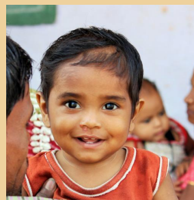
Apna Swasthya, Apni Pehel ke Madhyam Se Vyavahar Parivartan