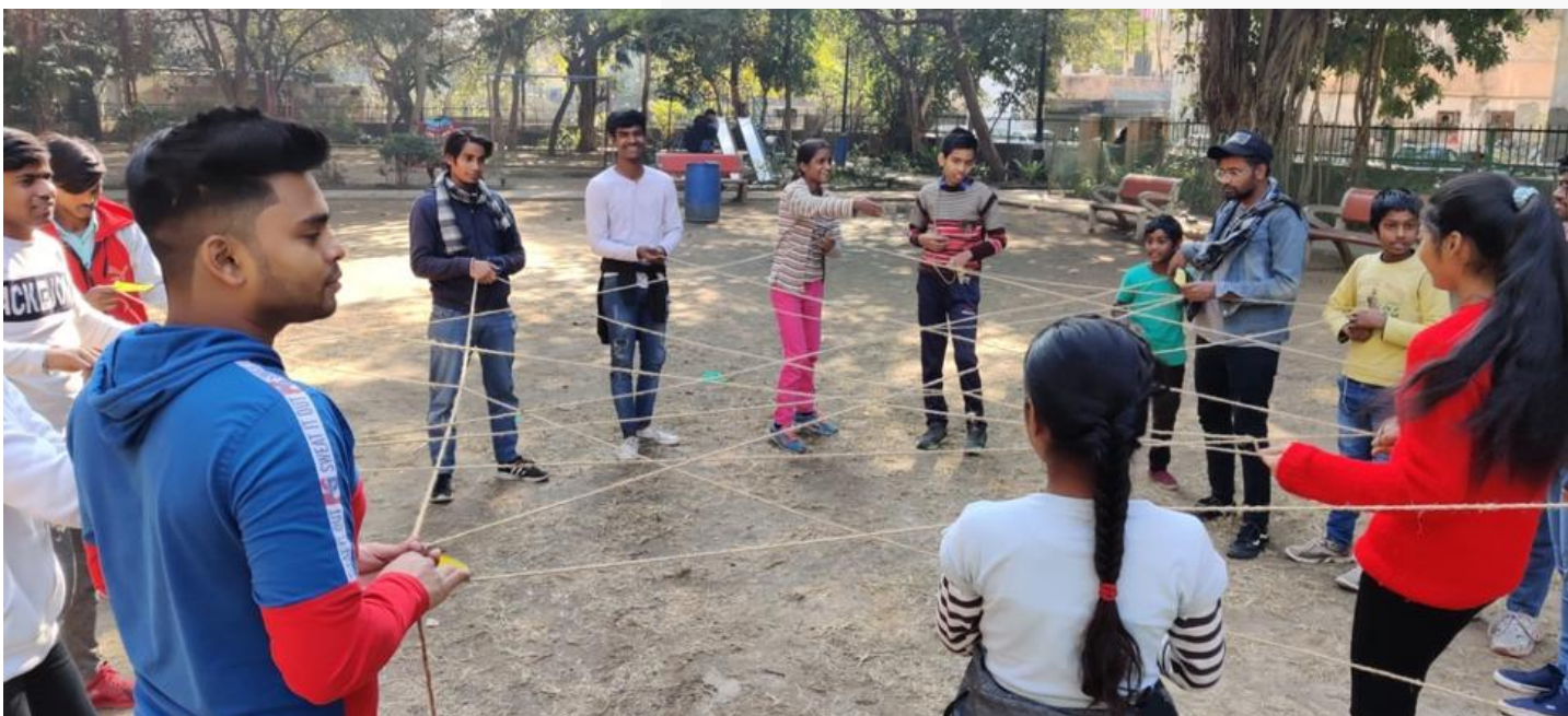
TESTING THE CURRICULUM WITH ADOLESCENTS

In the past year, PRIA has developed a Child Protection and Safeguarding Policy and staff have been trained on child protection and child abuse.