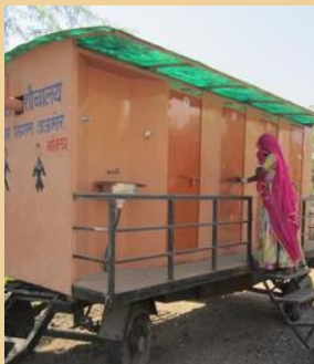
Status Paper on Urban Toilets in India