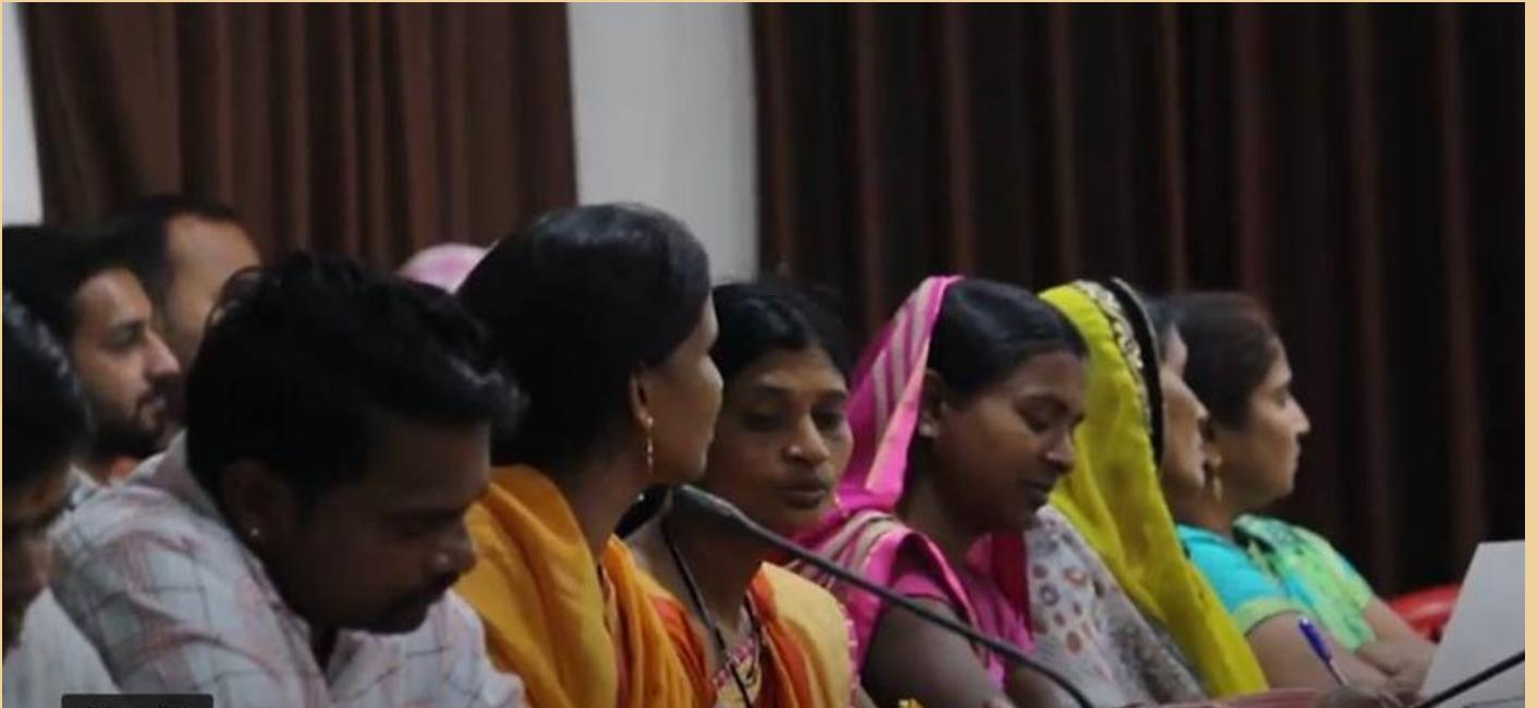
Power With and Power Within: Reinforcing Women's Participation in Local Governance