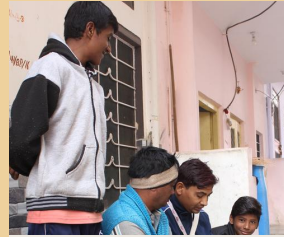
Monitoring and Action Tools for Citizens and Citizen Groups to Achieve Inclusive Sanitation in Cities