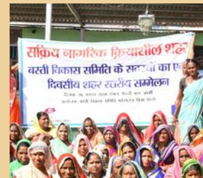
Shahri Garibon Ki Awaaz: Swachhta Sevaon Tak Pahunch Banane Ke Liye Sanghathan Nirman