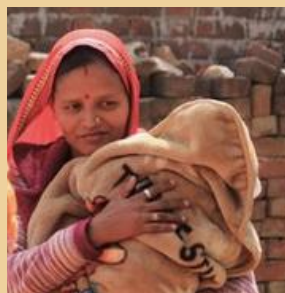
Matrutwa Swasthya Ko Panchyat ke Agenda Mein Lena