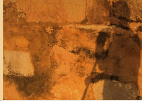
Workplace Diversity Assessment Of Mid-Sized Urban Local Bodies: Gender Analysis of the Sanitation Department in Three Cities