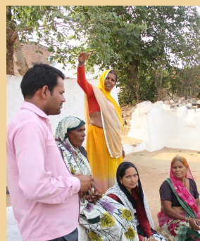
Panchyaton ki Pustika

Visit www.pria.org for more knowledge resources