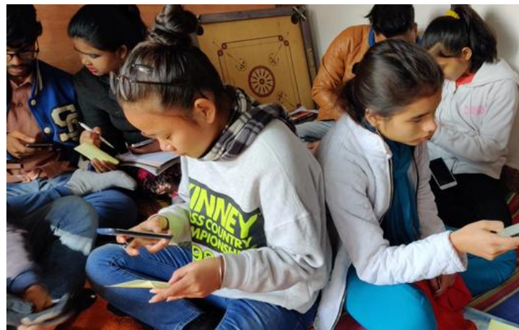
BRIDGING THE DIGITAL DIVIDE AMONG ADOLESCENTS