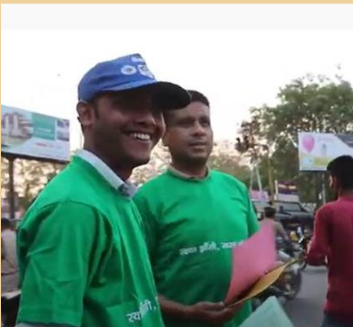
Redefining Sanitation Campaigns By the People, Of the People