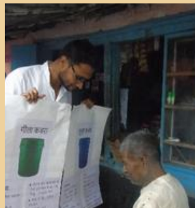
Status Paper on Solid Waste Management in Urban India