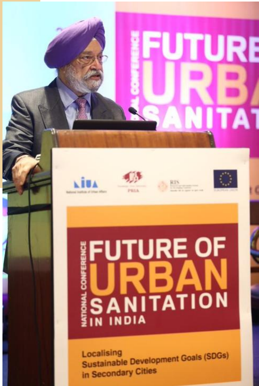
MINISTER HARDEEP SINGH PURI INAUGURATING THE NATIONAL CONFERENCE

The conference showcased scalable innovative solutions to address the challenges of inclusive and sustainable urban sanitation services; created a learning and knowledge platform by bringing together policy makers, researchers, experts, and practitioners on inclusive and sustainable urban sanitation services; and influenced policies and institutions to enhance the impact of urban sanitation programs. A special session on the last day of the conference provided valuable inputs and consensus in developing a framework, methodology, and mechanism for localising Sustainable Development Goals (SDGs) in Indian cities, with a particular focus on SDG 11.